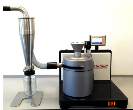
Fig. 5: PULVERISETTE 14 premium line with stainless steel Cyclone Separator converted for the comminution of larger amounts

Fig. 3 shows in comparison the particle size distribution after the comminution of the sample with the PULVERISETTE 14 classic line (20.000 rpm, 0.08 mm sieve ring with trapezoidal perforation, rotor with 24-ribs) and the PULVERISETTE 14 premium line (22.000 rpm, 0.08 mm sieve with ring trapezoidal perforation rotor with 24 ribs). In comparison, to the comminution with the PULVERISETTE 14 classic line the material is double as fine. The d50-value was halved from 26 \mu m down to 13 \mu m. The d90-value was also halved (63 \mu m to 33 \mu m).