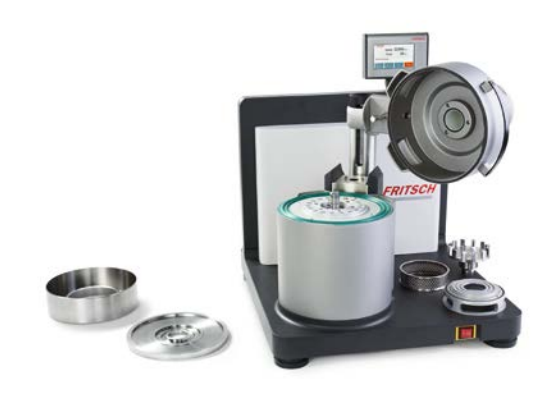
Fig.. 1: FRITSCH Variable Speed Rotor Mill PULVERISETTE 14 premium line

A never before achieved fineness with a centrifugal mill is attained in a short amount of time with the new FRITSCH PULVERISETTE 14 premium line (fig. 2). This became possible because the rotor peripheral speed was increased by more than 20% up to 110m/s, in comparison to instruments to date. A higher fineness is interesting in many aspects: Since many materials change their characteristics and their effects on the organism depending on the particle size, this is interesting for example in the area of exploration of new active components of pharmaceutical products.