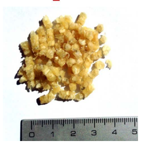
Fig. 3: Basic material: dried, pre-crushed mushrooms

An example from the industry of food and life science impressively shows the difference between established instruments to date (for example the PULVERISETTE 14 classic line) and the PULVERISETTE 14 premium line. With the PULVERISETTE 14 premium line dry mushrooms were comminuted (fig. 2) double as fine as it was possible with to date available Centrifugal Mills (fig. 3). The cell walls of mushrooms contain among other things the so called β-1,3glucan, which in vitro and in animals based on in-vivo examinations stimulates the immune system and supports et al. the healing of wounds<sup>[1], [2]</sup>. Due to a better fine grinding the active component can be extracted more effectively. The familiar cytotoxic effect of \beta -glucan in the course of cancer treatment is based rather on the impurities of the active component, because if instead of the concentrated, pure βglucan was used, no cytotoxic effect was detected [3].